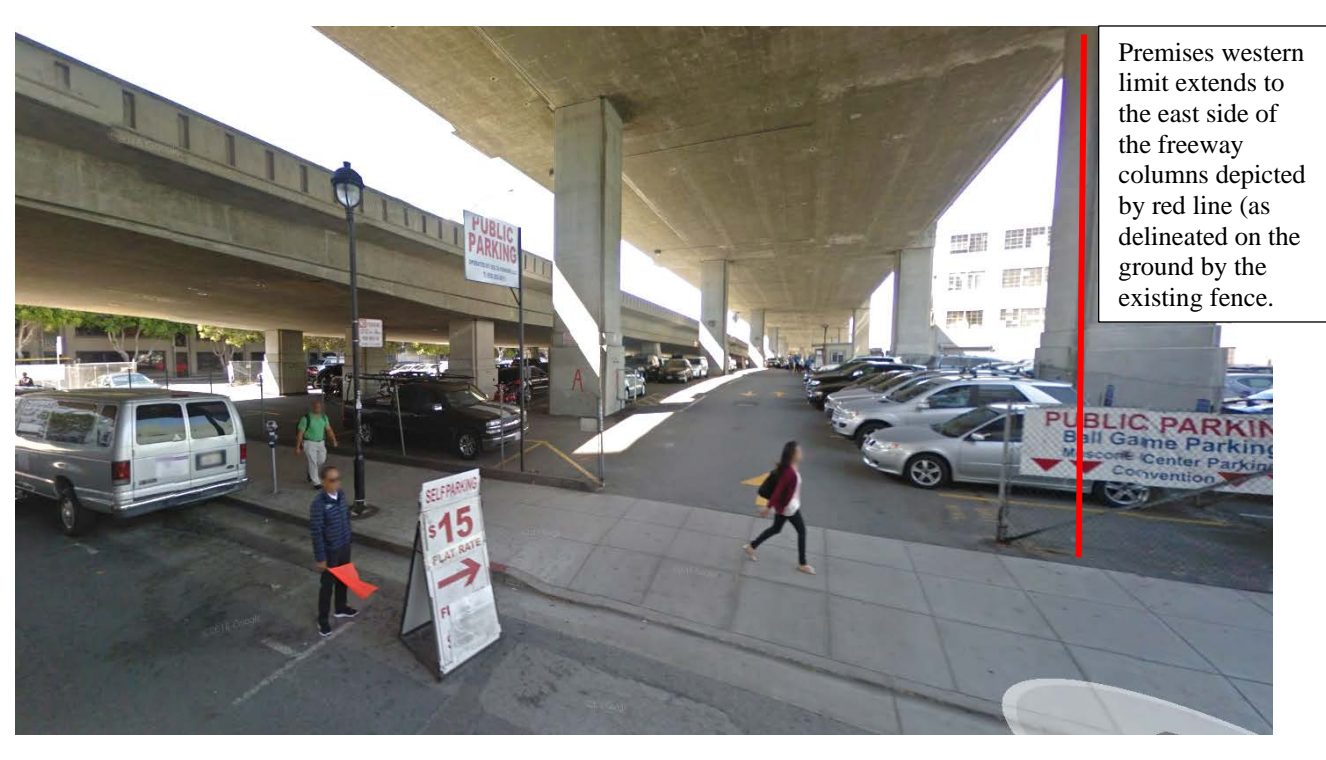
From 2^{nd} St. looking south by Stillman St.