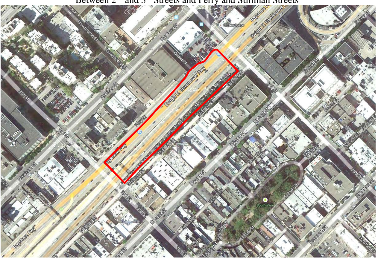
SF-BT-04 Between 2^{nd} and 3^{rd} Streets and Perry and Stillman Streets