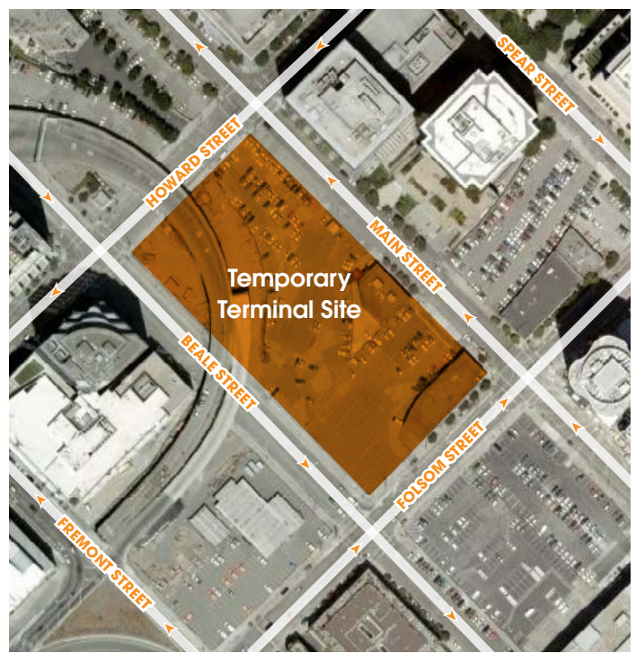
Map of Project Area +

The Transbay Joint Powers Authority (TJPA) continues to make exciting progress toward building the Transbay Transit Center, the "Grand Central Station of the West." Ground-breaking commenced in December 2008 for the Temporary Terminal that will serve bus passengers while the new Transit Center is under construction.