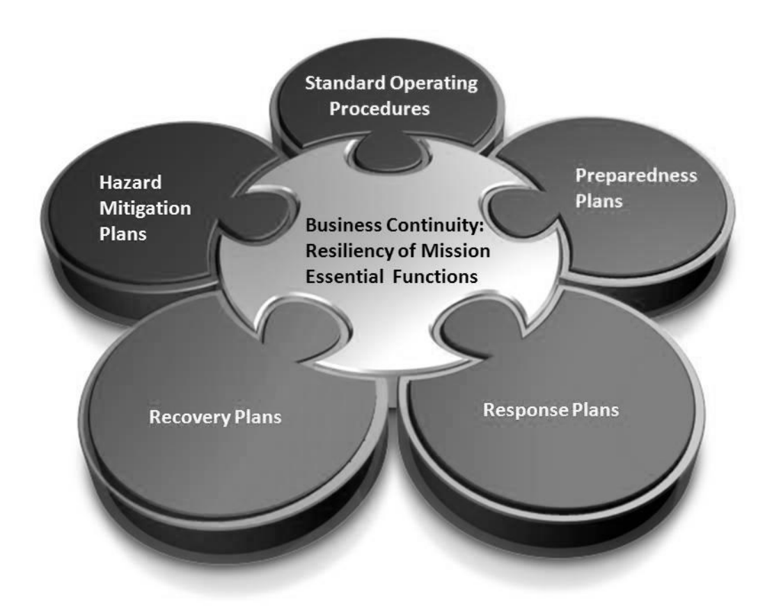
Figure 1: BCP Relationship with Other Plans

The plans that supplement this BCP are listed in Table 3.