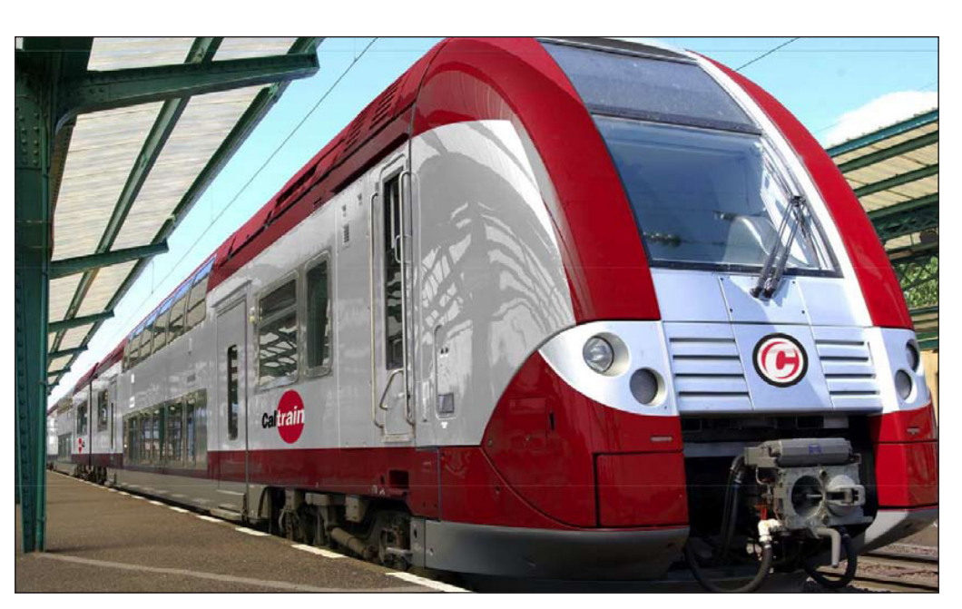
Caltrain EMU Vehicle