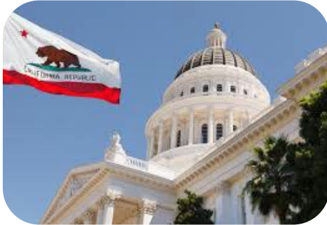
TJPA Sponsored Legislation: AB 2308 (Haney)