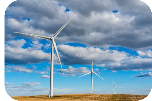
Cap and Invest Expenditures, including Transit and Intercity Rail Capital Program