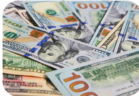
State Budget Advocacy