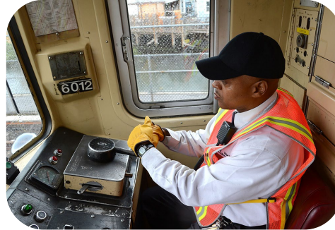
Transit Operations Funding Stability