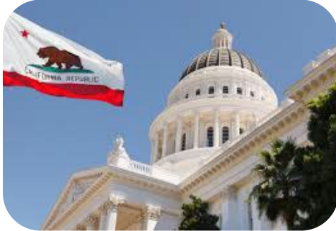
TJPA Sponsored Legislation: AB 2308 (Haney)