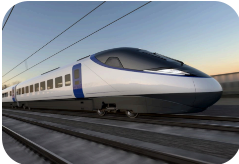
High Speed Rail Plan Implementation and funding for Bookend Projects