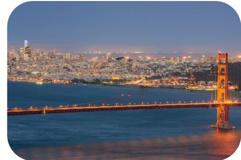
Honoring Existing State Funding Commitments