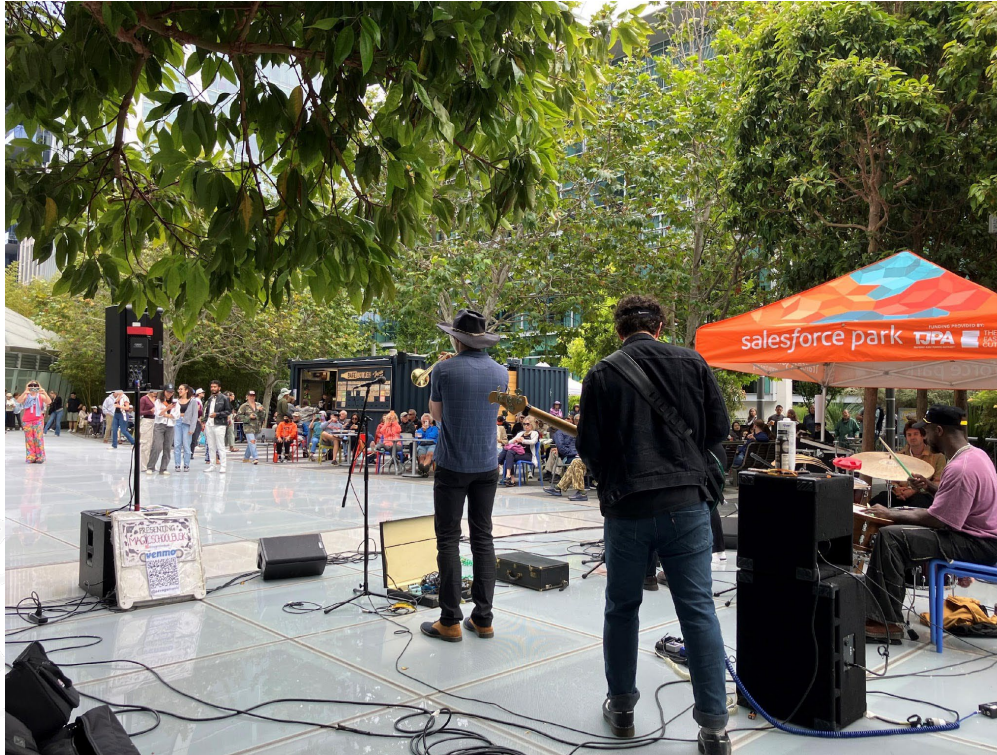
7th Anniversary Celebration of Salesforce Transit Center and Park: Over 1,000 attendees on August 16, 2025