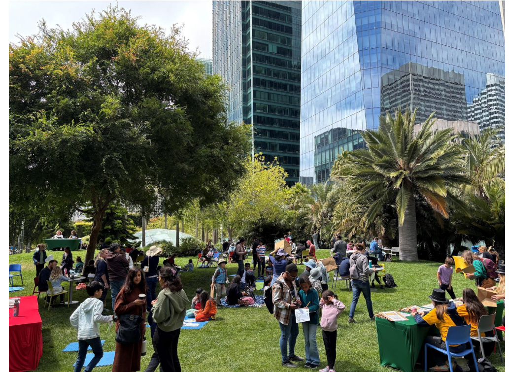
Wizard's Academy Math Quest: Over 300 attendees on August 24, 2025