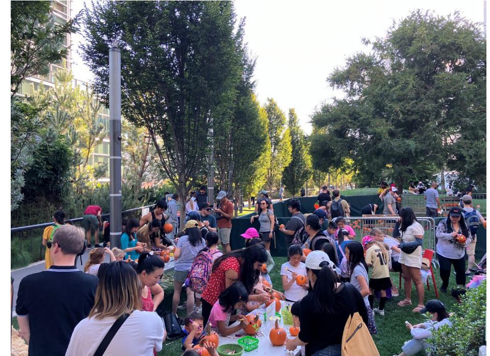
Fun for the whole family!

Harvest festival: October 5 from 3pm to 6pm