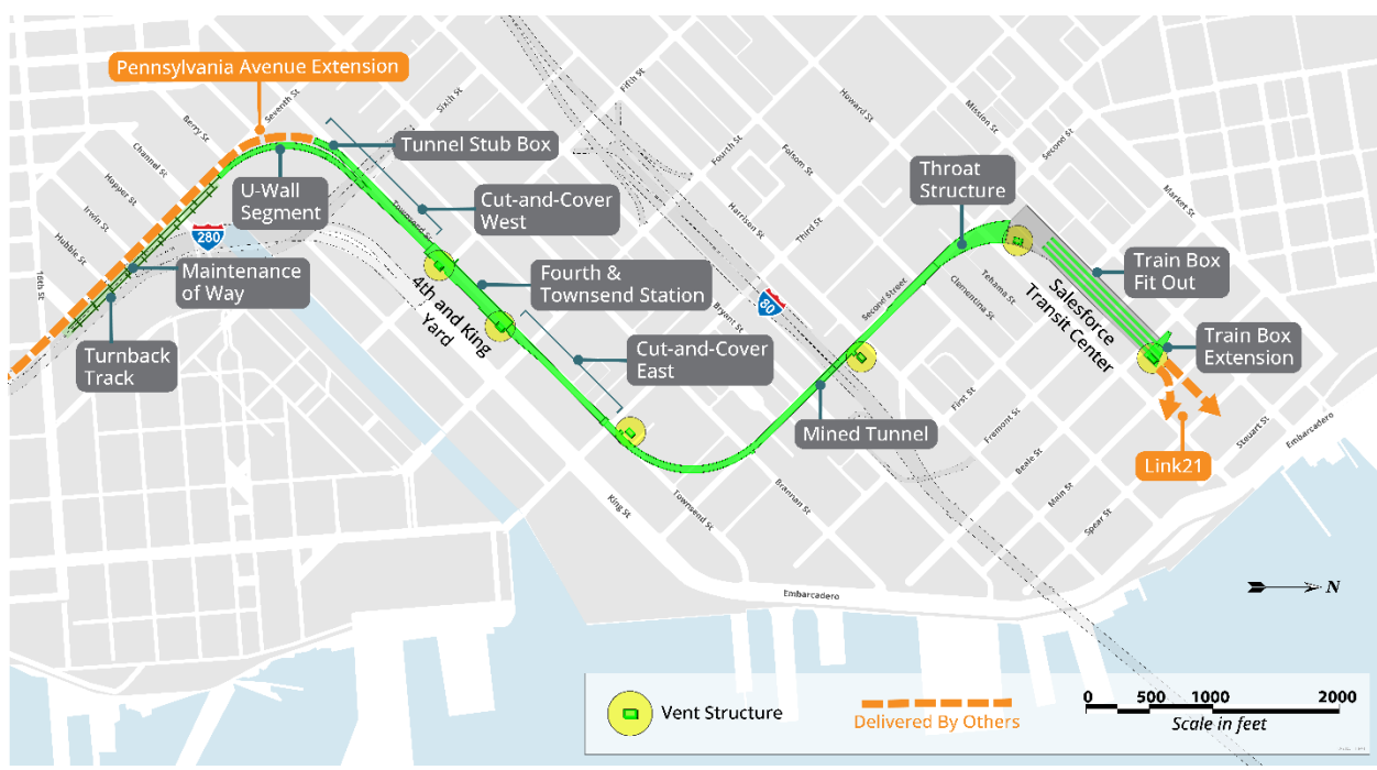
Figure 1. The Portal Main Components

The Portal alignment (shown in Figure 1) begins at the east end of the Center's below-grade rail station at Beale and Minna streets. At the west end of the station, the station's six tracks transition to two tracks, bearing west through a throat structure and then continuing southward in a tunnel under Second Street and westward under Townsend Street to a new underground station at Fourth and Townsend streets. West of the station, near Seventh and Townsend streets, the tracks then ascend to grade via a u-shaped retained cut (referred to as the "u-wall"), then southward at-grade to 16th Street, south of the existing Caltrain terminal station and 4th and King Yard. A tunnel stub box extends side-by-side with the u-wall to allow for a connection to the future Pennsylvania Avenue Extension—a concept being explored by the San Francisco County Transportation Authority that would grade-separate the rail alignment from 16th Street and Mission Bay Drive, which are surface streets farther south of The Portal.