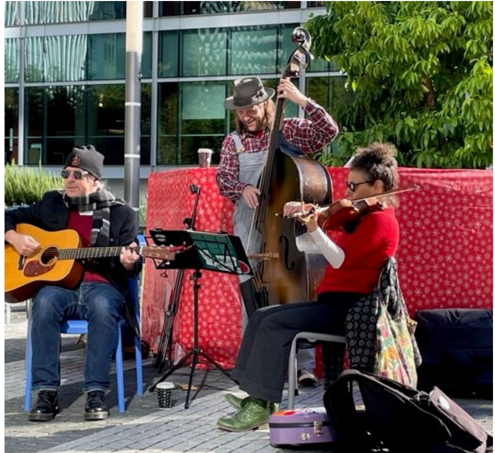
Skillet Licorice performing Dec 17 part of Winterfest