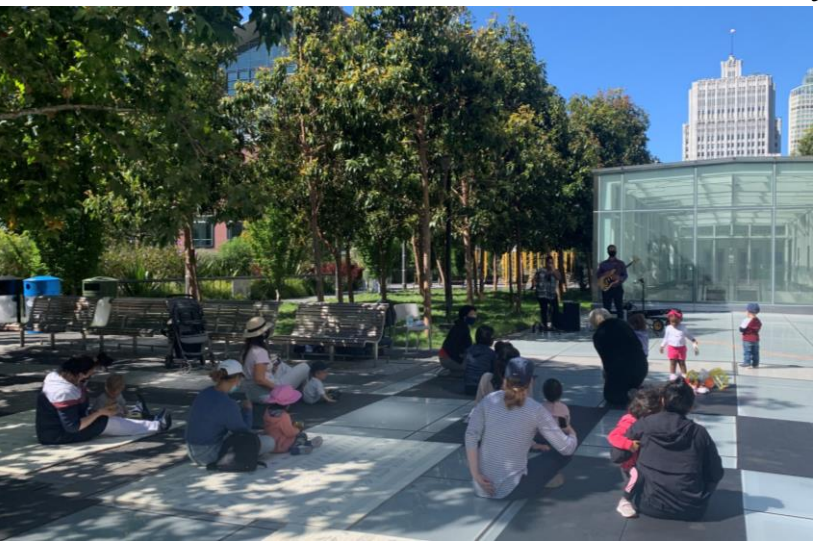
Lunchbox Music Friday