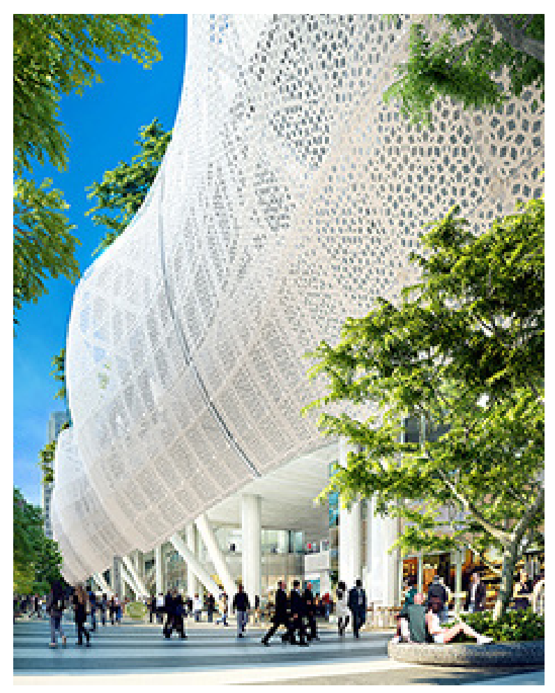
Rendering of the new Salesforce Transit Center at Natoma Street. Image courtesy of Pelli Clarke Pelli Architects.

term to operate and maintain a safe, clean and inviting public transit center.