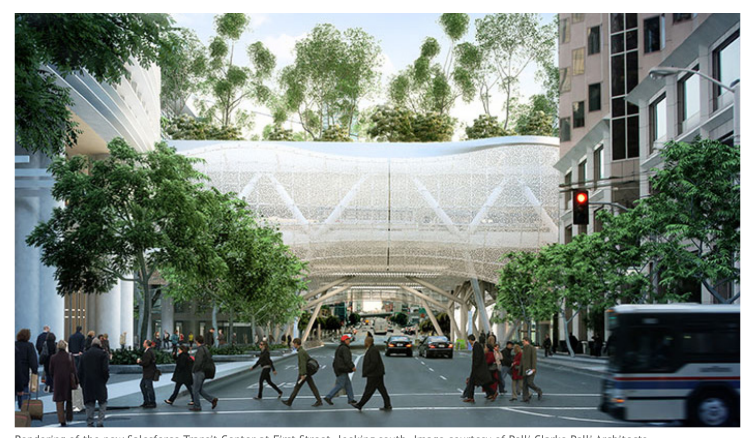
Rendering of the new Salesforce Transit Center at First Street, looking south.

The TJPA Board of Directors has approved a naming and signage rights agreement with salesforce.com, the San Francisco-based cloud computing company. This unique and exciting public-private partnership will generate more than $110 million over a 25-year