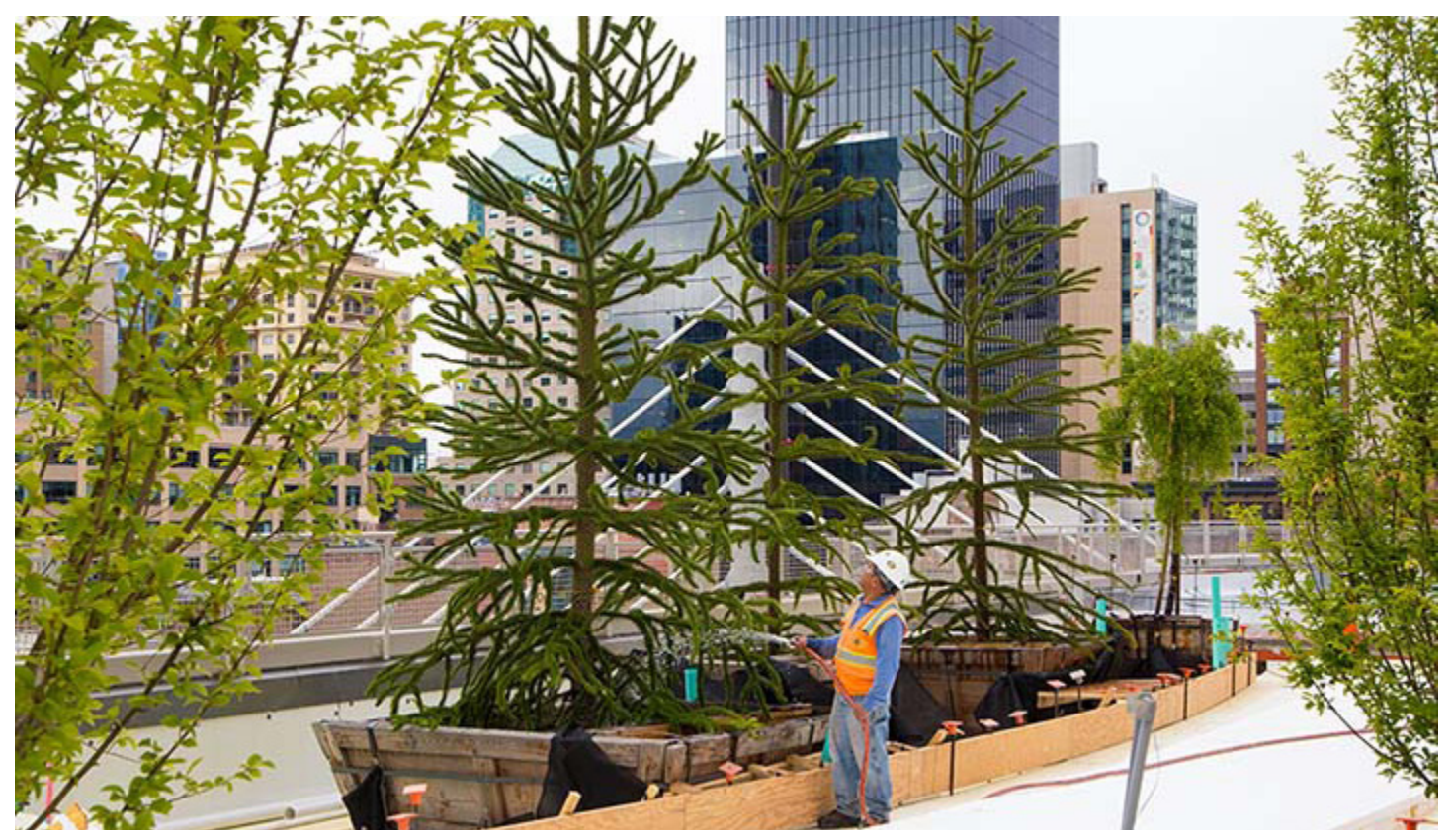
The three monkey puzzle trees above are part of the Chilean garden, one of thirteen themed gardens around the perimeter of the park.

The largest trees have been arriving on the project site intermittently since January, as installation of the rooftop drainage, piping, and electrical systems is completed. Working at night, crews hoist the crated trees up to the park using a 35-ton crane to place them in their final location. The trees remain in their crates and are supported in place until the park's subsurface material, including geosynthetic fill and soil, is built up around them.