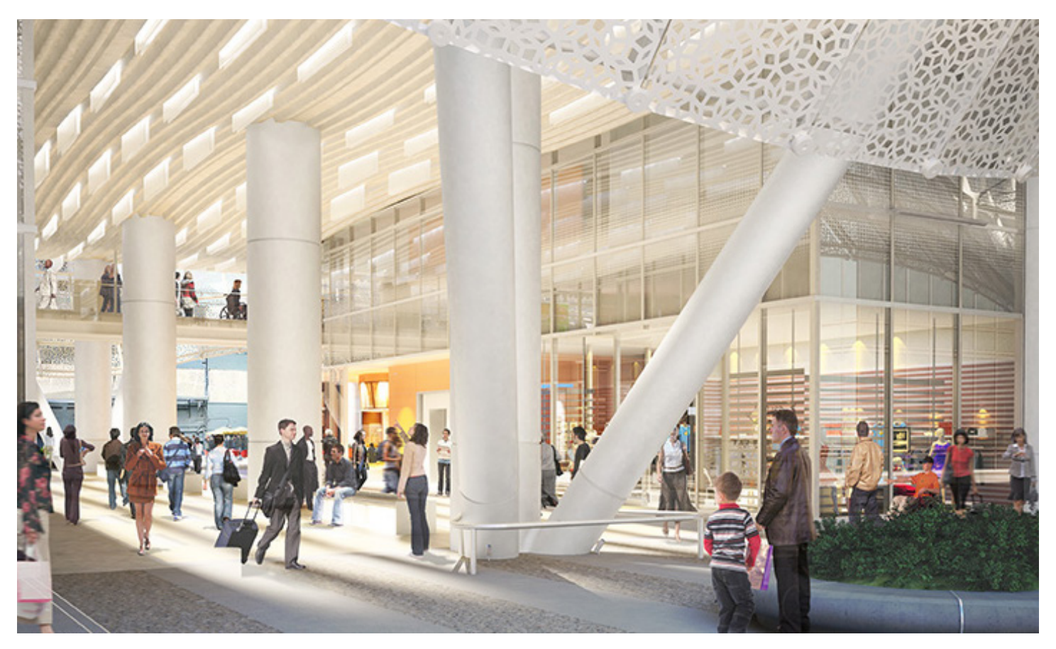
The retail area is concentrated at the west end of the building. The rendering above shows storefronts in the Shaw Alley pedestrian pass-through between Minna and Natoma streets.

The Lincoln team will oversee operation, maintenance, retail leasing and open space programming