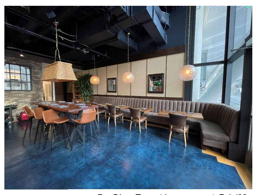
Per Diem Tenant Improvement, Feb '23