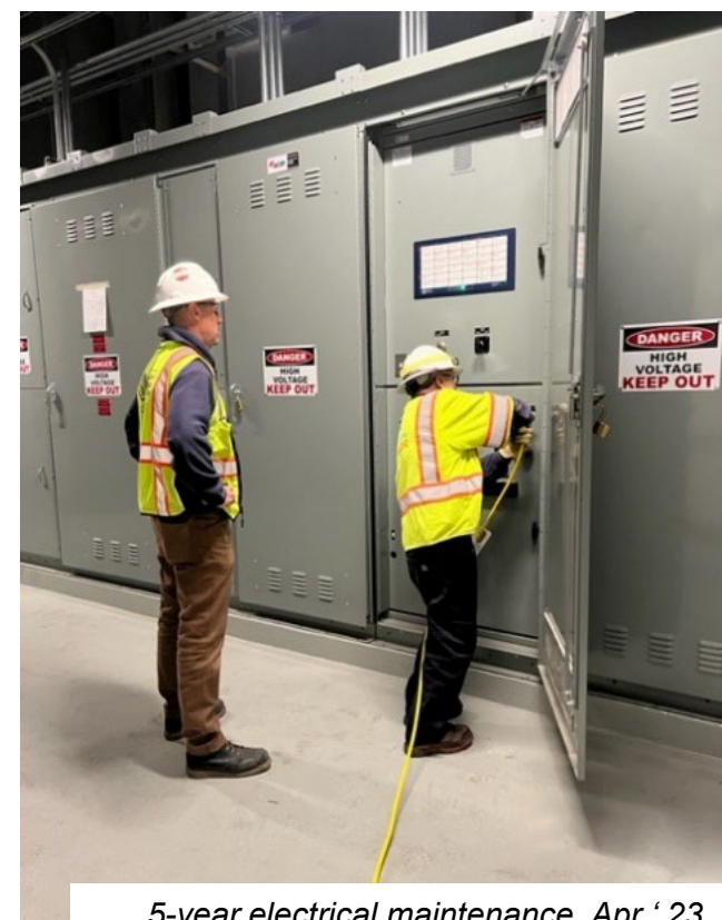
5-year electrical maintenance, Apr '23