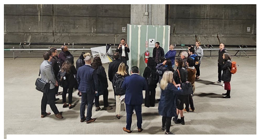
California High-Speed Rail Authority Team, Dec '23