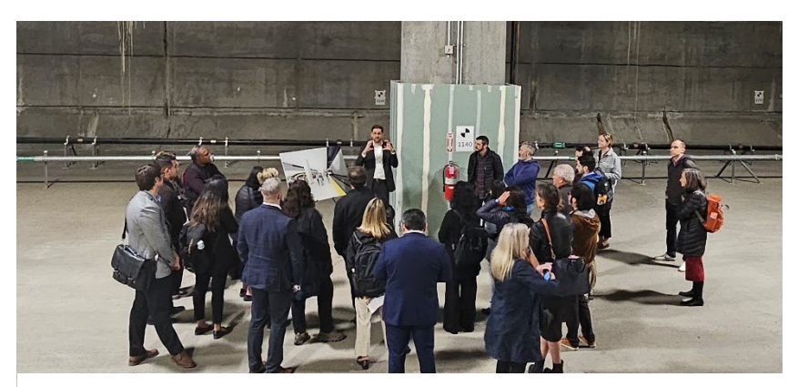
California High-Speed Rail Authority Team, Dec '23